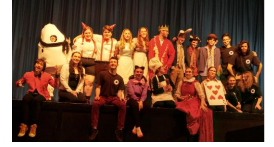
Performing at White Oaks Secondary School, Oakville