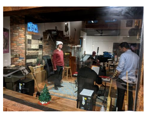
Recording original song at Grant Avenue Studio, Hamilton