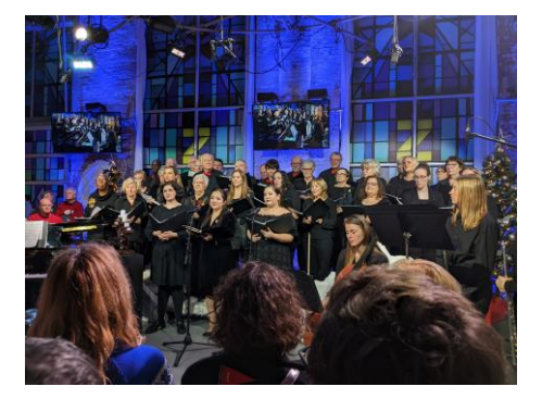
Recording a Christmas Special at Zoomer Television Studios, Toronto