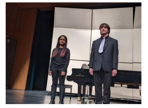
Sound check at the McIntyre Performing Arts Centre, Hamilton