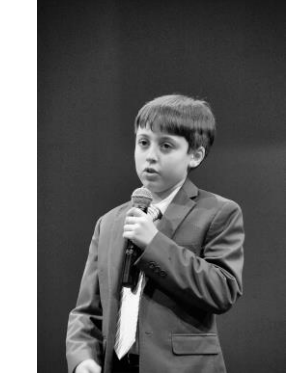
Performance at the Edison Ballroom, New York City