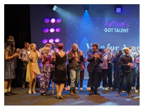
Finishing a performance at the Mermaid Theatre, London, England