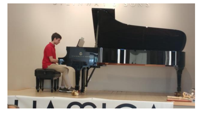
Performance on Steinway Piano, Mississauga