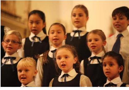
Performing in the Oakville Children's Choir