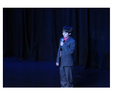
Performance at the Edison Ballroom, New York City